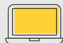
Recall on Apple's 15-inch Macbook Pro